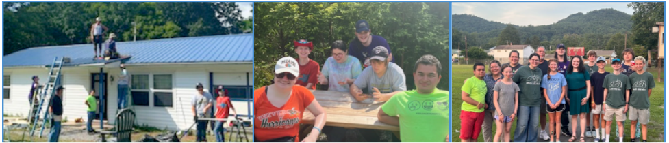
Faith youth serving in central Appalachia last year.